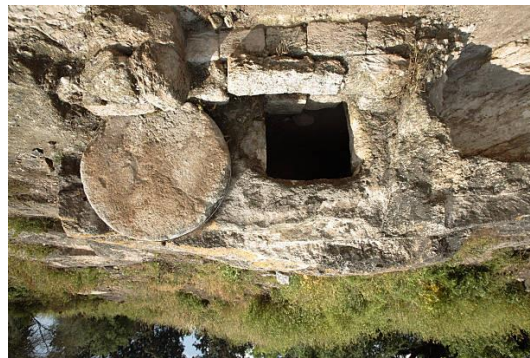
He Rose from the dead.