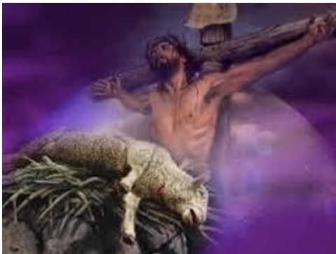
The Lamb of God

Romans 10:9 states that if you confess with your mouth that " Jesus is Lord " and believe in your heart that God raised him from the dead, you will be saved. " This verse is a cornerstone of Christian belief, emphasizing that salvation comes through a combination of public declaration and internal belief in Jesus's resurrection.