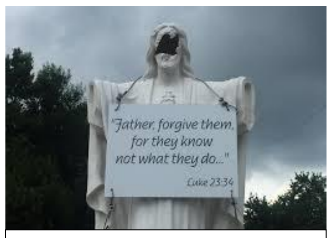
Statue of Jesus, hands torn off and face smashed.

"For Christ did not please himself; but, as it is written, The insults of those who insult you fall upon me." (Romans 15:3)