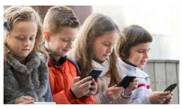
more for some teens.

The smart phone is not a bad thing, it just depends who is the boss. You or the phone? It should be a family rule, that when the family members sit down to eat, whether at home or in a restaurant, the phones must be put away. Don't be timid about this....moms and dads are the rule makers....not the phones.