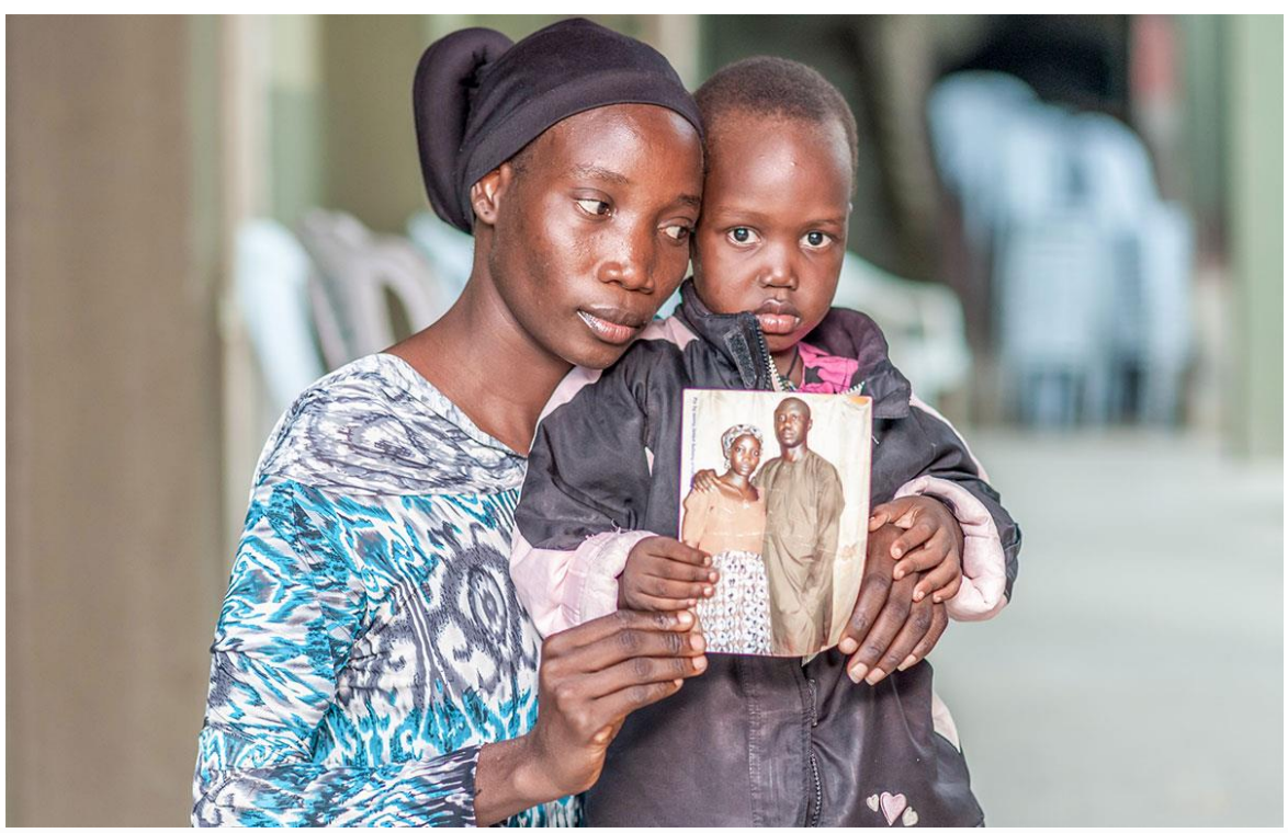
The martyrs of Nigeria Photo

Nigeria, a nation of close to 200 million, is made up about evenly of Christians and Muslims. Christians live predominantly in the South; Muslims are the majority in the North.