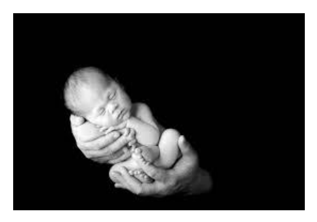
Is this a photo of a baby left to die or is it a photo of 'protecting women's health"?

A child that is born alive in the US is a citizen protected by the US Laws and Constitution. So why would the Washington Democrats say this "is about a woman's right to chose life or not....and it is about her health?