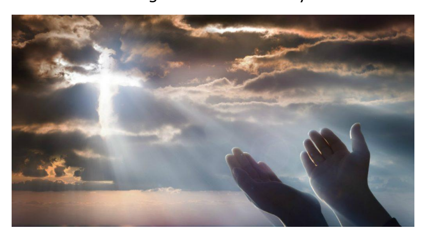
St. Paul Ministry, Cypress, TX

The child is born alive after a botched abortion attempt is a living being. The devil has made a child born alive a thing to be killed. Very sad.