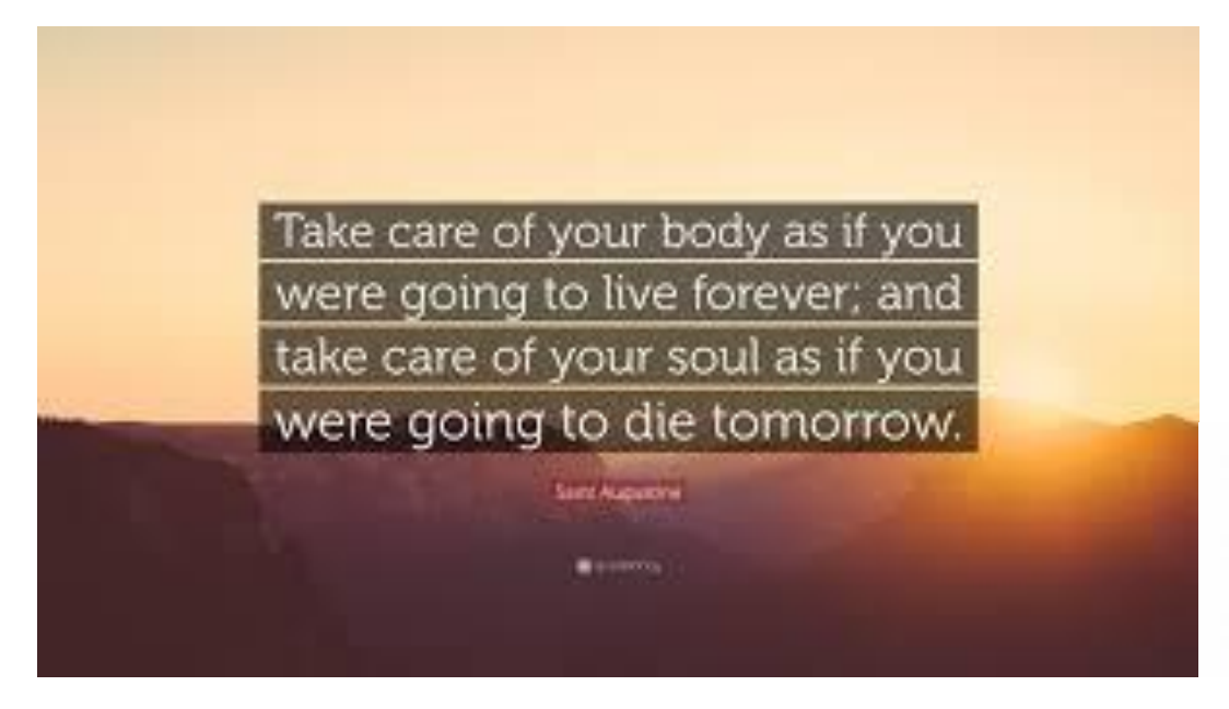
St. Paul Ministry, Cypress, TX

Our mission statement is to motivate people to pray and to be Christian examples in their work, home and with others, for those needing the Light in a world of Darkness.