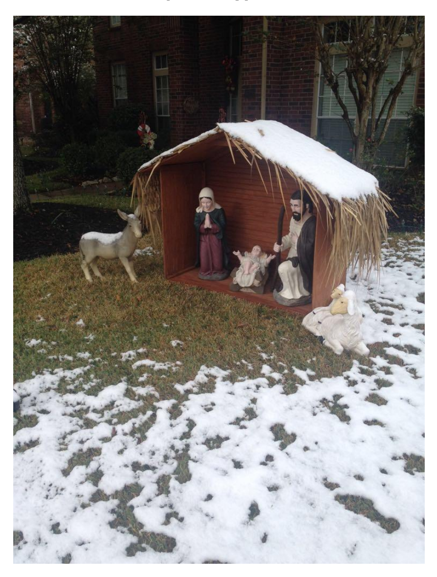
The Miracle of the Birth of Jesus Christ