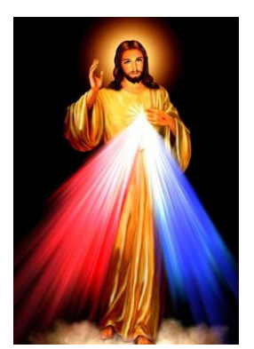
Trust in Jesus