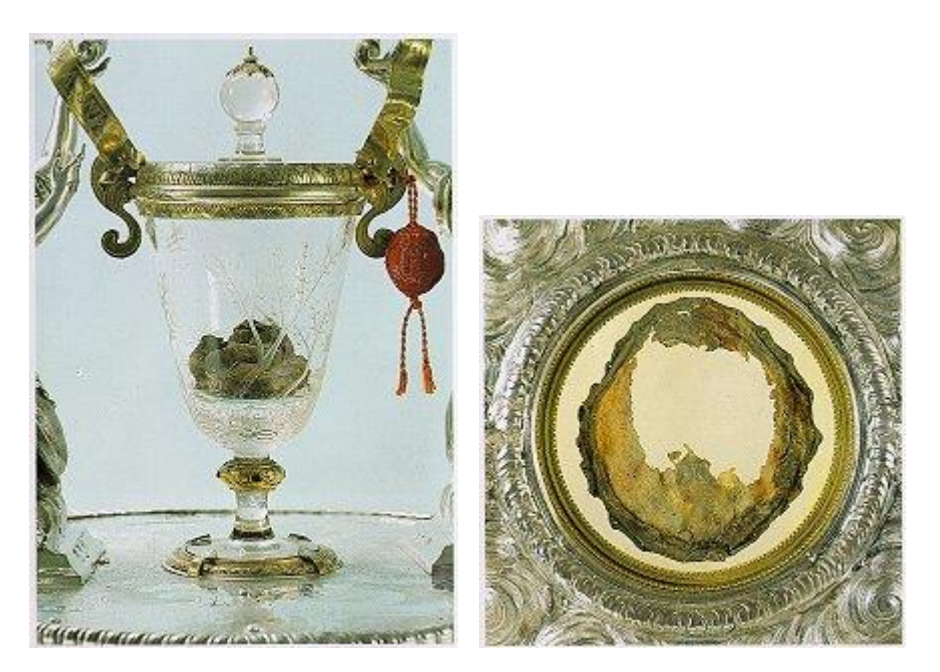
The Blood is real Blood The Flesh consists of the muscular tissue of the heart

In 1973, the Higher Council of the World Health Organization (WHO) appointed a scientific commission to verify the Italian doctor's conclusions. The work was carried out over 15 months with a total of 500 examinations. The conclusions of all the researches, confirmed what had been stated and published in Italy.