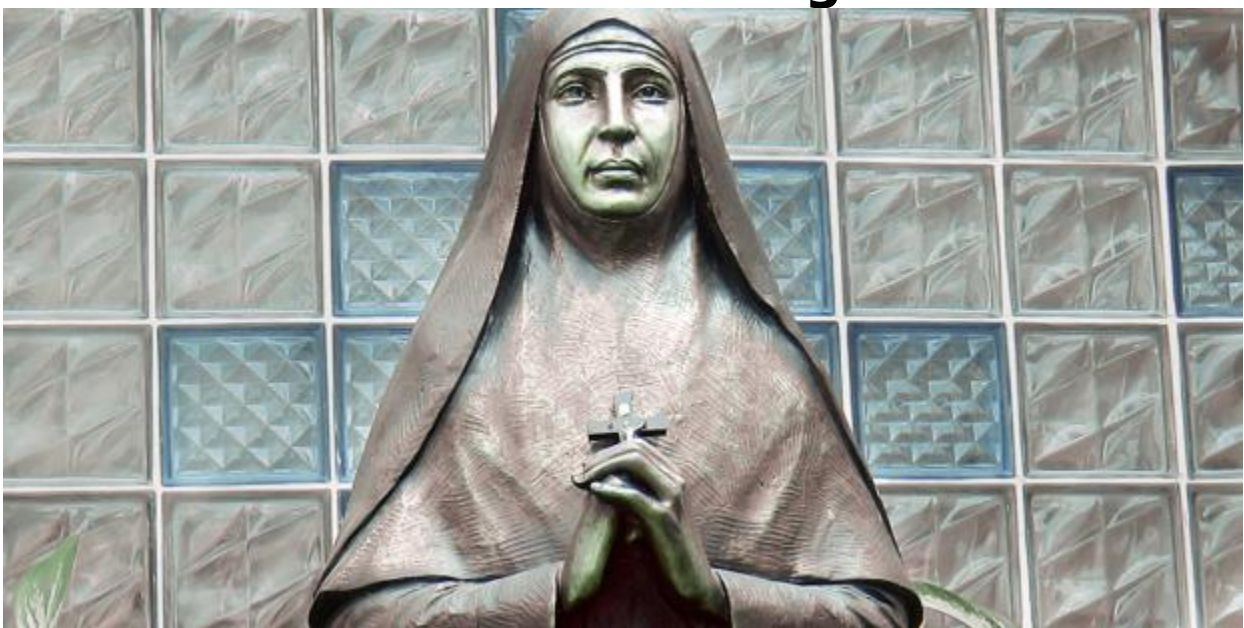
By: Verghese V Joseph - published on 02/14/19